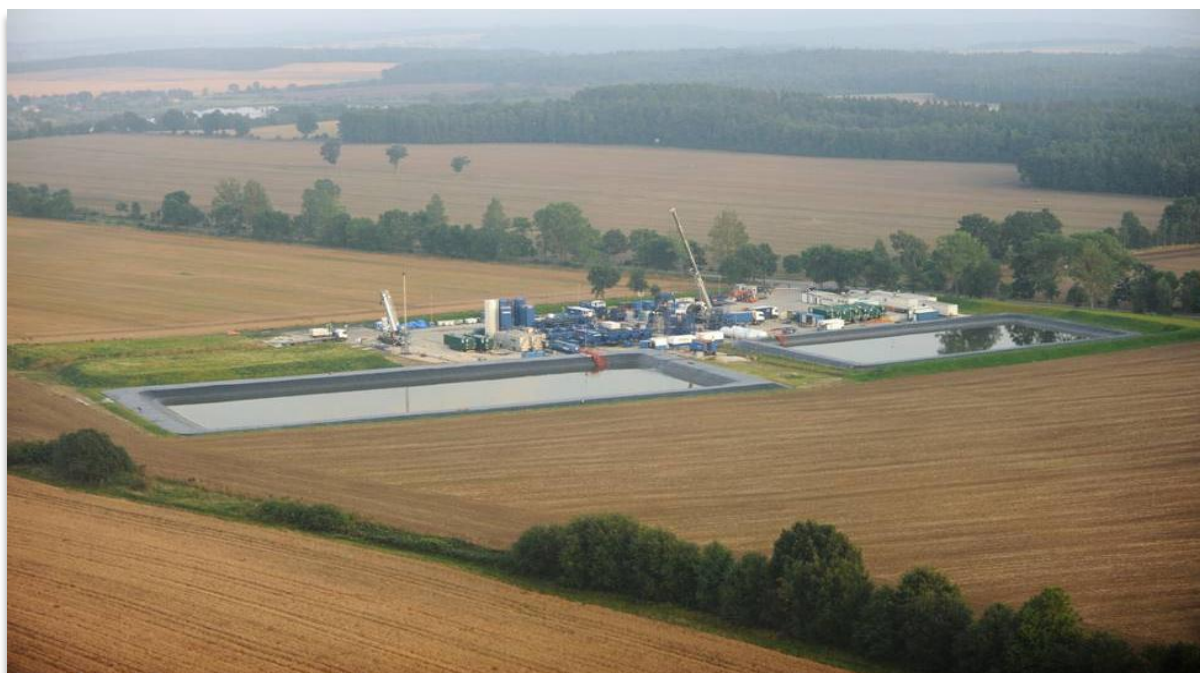
Operations at Lebien LE-2H

Conclusion of the testing of the Lebien LE-2H and Warblino LE-1H wells will materially advance the Company's understanding of the regional geology in the area of its Baltic Basin licences and of its licences' potential for production of gas and liquids from the organic-rich lower Palaeozoic shales in the Silurian, Ordovician and Cambrian intervals. The Company expects to improve further its regional geological interpretation through data exchanges with other licence holders in the Baltic Basin and adjacent basins, discussions for which are ongoing.