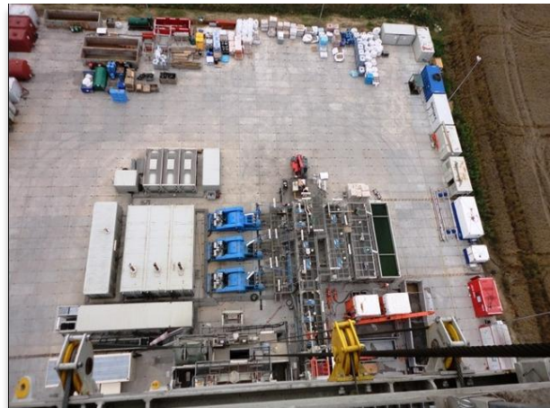
Operations at Warblino LE-1H

During the six months ended 30 June 2011, the Company continued to progress its exploration programme on its six Baltic Basin licences. Following on from the successful production of gas from the Lebien LE-1 well on its Lebork licence in December 2010, the Company conducted a second diagnostic fracture injection test ('DFIT') on this well in March 2011. At the Legowo LE-1 well on its Cedry Wielkie licence, the Company performed two DFITs on the target lower Palaeozoic shales in January and February 2011. Following conclusion of these tests and an appraisal of the results of both wells, the Company has selected the western Baltic Basin licences, particularly Lebork and Damnica, on which to prioritise the next phase of its exploration activity.