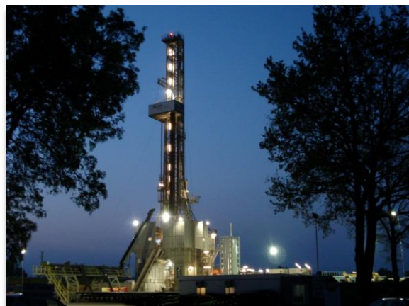
3Legs Resources pursues best practice in all its operations