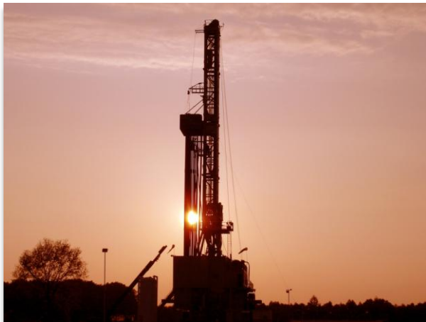
Operations at Lebien LE-2H

In the Polish Baltic Basin, currently at the forefront of emerging shale gas plays in Europe, 3Legs Resources is well placed to continue to leverage its first mover advantage by pursuing an active drilling programme, in conjunction with its co-venturer ConocoPhillips. The Company expects to have first test results from the first two horizontal shale gas wells in Poland, the Lebien LE-2H and the Warblino LE-1H wells drilled on the Company's Lebork and Damnica licences respectively, in the fourth quarter of 2011.